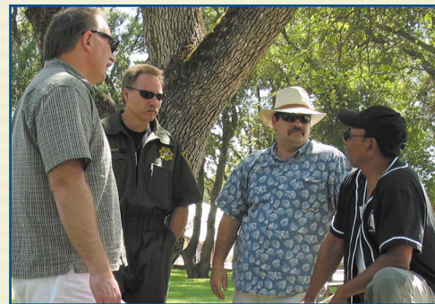
lone Townhall Meeting.

Although Front Street has not been published in the last year and a half, CCPOA is aware of the issues and problems occurring throughout the California Youth Authority (CYA) and specifically at NA Chaderjian (NAC). CCPOA executive committee members have attended many town hall and chapter meetings across the state and have listened to staff concerns about forced overtime; the lack of training; the confusion concerning "use of force"; unsafe state vehicles; vacant positions; staff assaults; improper investigations; faulty cell doors; ward rights vs. ward accountability; the worthless DDMS system; and faulty cell door indicator panels that are supposed