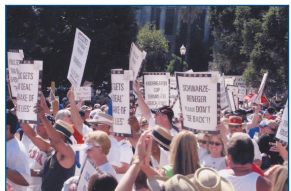
Members gather for a “March on the Capitol.”

Newspaper reports that “the prison guards union” is the financial burden on the department and the state is egregious. Management’s mismanagement is the real cause!