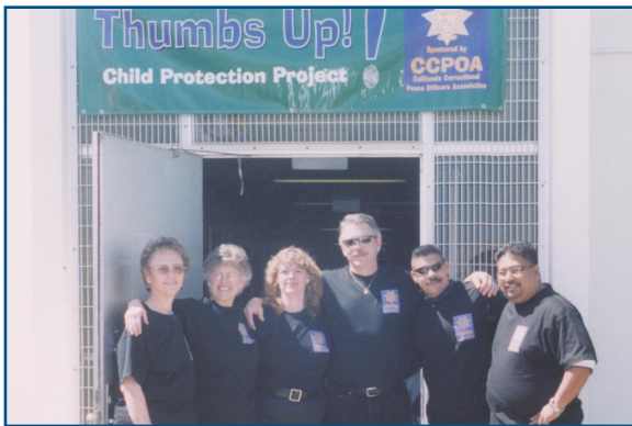
Members at the NCYC K-9 Trials.

The Thumbs Up project is requested throughout the state by various organizations and has been operating for over eight years. Currently, the department is only authorizing one member at a time per institution to use RTB — effectively obstructing the operation of the program. The agency secretary has made the decision to deny the public one of the excellent community programs — provided free of charge by CCPOA — for the safety of children. The agency says that the use of RTB has a direct impact on their finances. But nothing could be further from the truth. Participation by the members on RTB is of no cost to the agency, as the members donate their own time to the release time bank. Regretfully, CCPOA must now cancel future events.