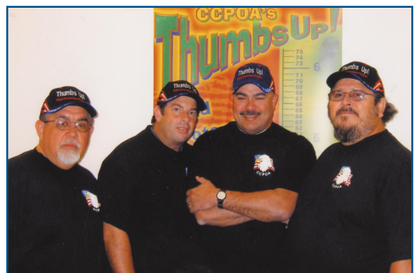
Pasa de Robles members at the Thumbs Up Visalia event.