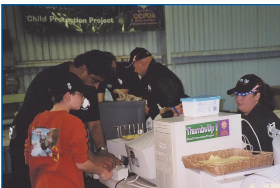
Members volunteer their time at the Cal Expo event.