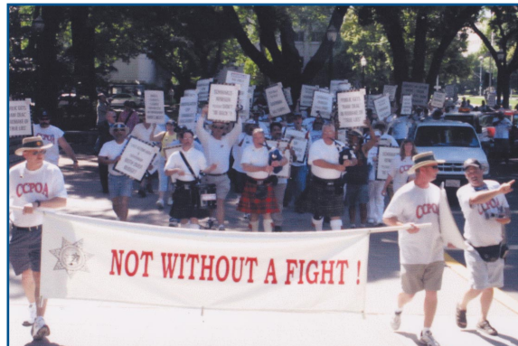
Hundreds of members “March on the Capitol” in protest.

But, when a ward escapes and word of his criminal history is broadcast, the ward suddenly becomes a serious gang affiliated felon. The simple truth is that 75.3 percent of CYA wards are entrenched in gang lifestyles, are over 18 years old and never did function in society. The local high schools, continuation schools, community programs and juvenile centers could not help these criminals. If you check their entire criminal history, you would find many of them have a multitude of felonies including murder, attempted murder, assault and battery, drugs, robbery, burglary and sex related crimes. If they were adults, you would be surprised how many have exceeded the three strikes law.