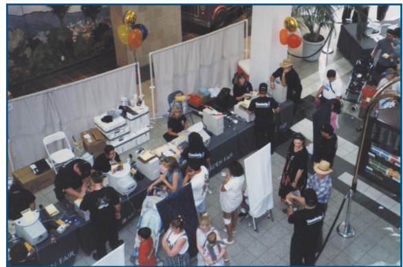
Parents and children line up in Manchester Mall in Fresno.