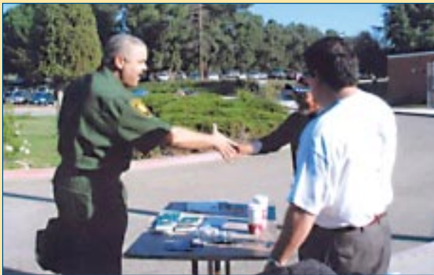
CCPOA Leadership visited facilities over the holidays to personally express their gratitude to officers working during Thanksgiving, Christmas and New Year's Day.