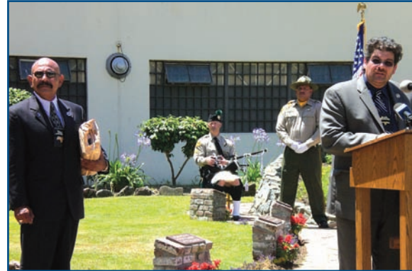
San Quentin 10th Memorial