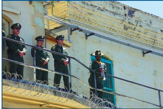
San Quentin Officers on the wall