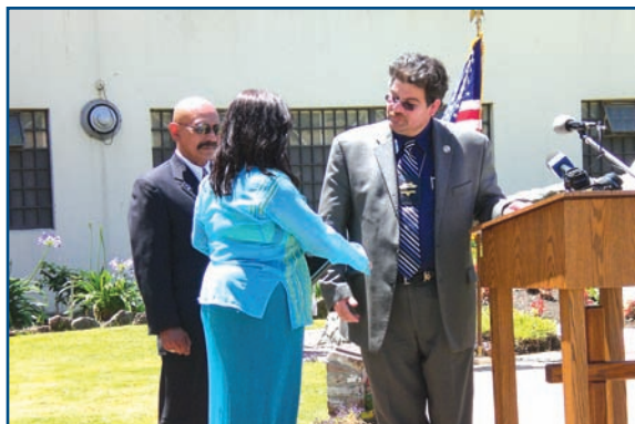
San Quentin 10th Memorial