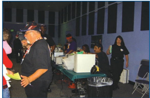
Patton Cancer Event.

You will also not see CCPOA at any town halls, because DJJ started interpreting our attendance as a CCPOA approval of their plan and waiving our right to negotiate for the members.