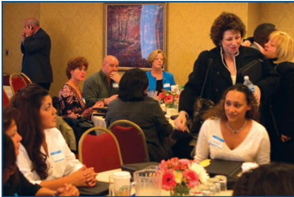
CCPOA Womens' Forum