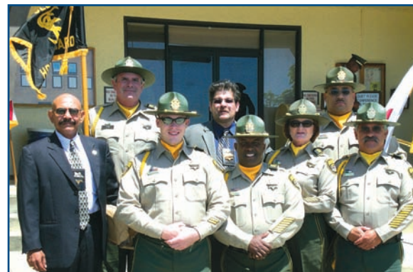
San Quentin Honor Guard