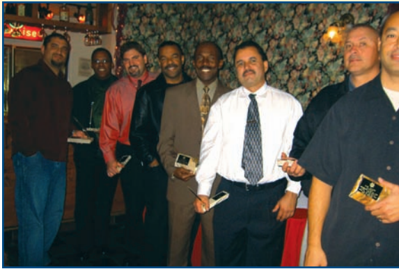
OH Close Honors Members