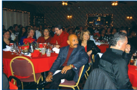
OH Close Membership Dinner