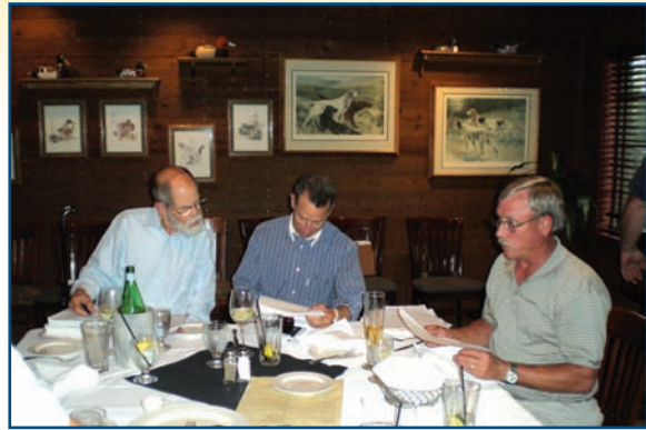
SCC prepping for court case