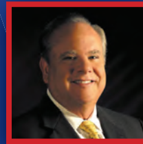
STATE TREASURER Bill Lockyer (D)